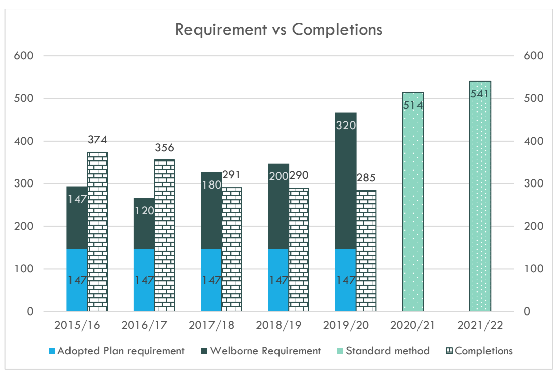
Chart 1: Housing delivery performance

3.5 The number of houses built in any given year is, in part, a reflection of the number of sites with planning permission. There is a lag between the granting of planning permission and the completion of new home on sites, often around 1-2 years for sites with detailed planning permission and 2-3 years on sites with outline planning permission. The lag time between the granting of planning permission and commencement is dependent on the size of the site and other related matters (such as the provision of infrastructure as well as the impact of extraneous events such as the impact of COVID 19). Fareham Borough Council recognises that it did not deliver sufficient housing to meet its locally identified housing need over the last three years.